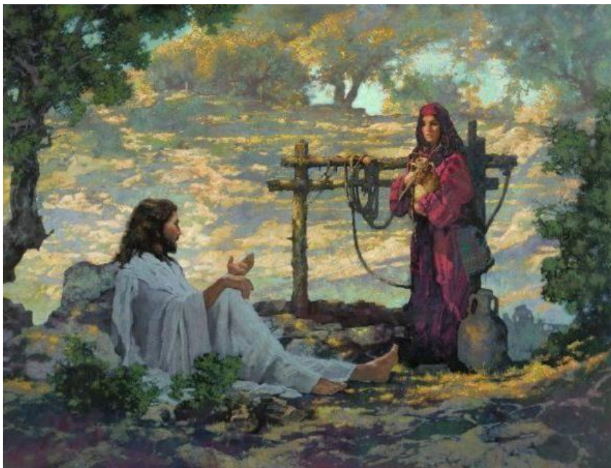
Woman at the Well

The season of Lent is a period of 40 days when we prepare for Easter and reflect on the example of Jesus. It is associated with the time Jesus spent in the wilderness when he fasted for 40 days and nights and was tempted by the Devil. The themes of Lent include self-examination, penitence, self-denial, study, almsgiving, and preparation for Easter. Ash Wednesday services set the tone for Lent, with a focus on penitence (saying sorry for and turning away from sin).